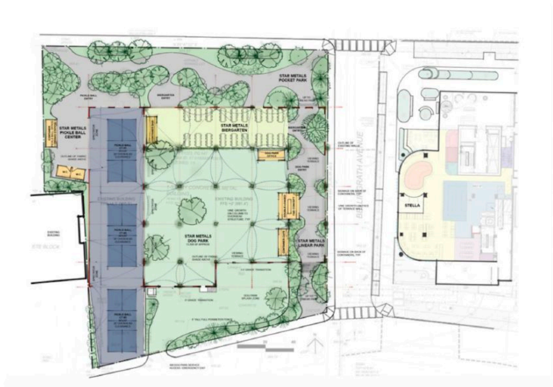
The urban park site plan located immediately west of the rising Stella at Star Metals tower.